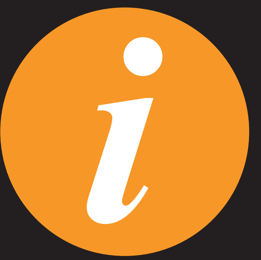
Lake Merritt BART, Oakland, Sign 20317